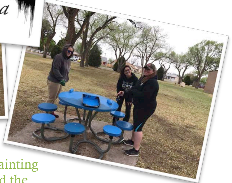
NSSLHA students painting picnic tables around the community.