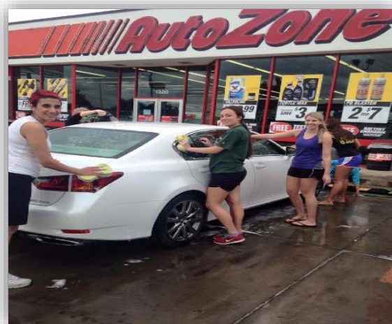
NSSHLA Car Wash

In the fall semester, NSSHLA had fun activities such as a pizza party and a car wash. For community service, NSSHLA donated money from that car wash to a local family in need, as well as sold T-shirts to promote Alzheimer's Awareness, and donated the proceeds to the New Mexico Chapter of the Alzheimer's Association.