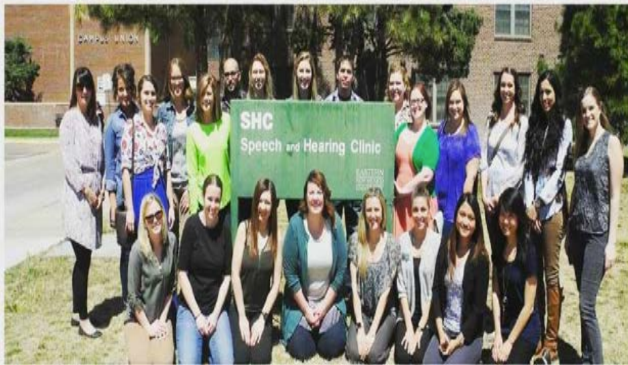
2016 Spring Cohort

The new class of graduate students arrived on January 12, 2017 for their three-day orientation. The new cohort represents a variety of states and backgrounds.