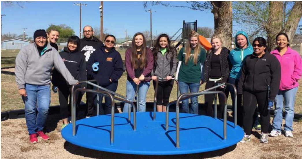
NSSLHA participating in Eastern in Action

NSSLHA had a very busy spring. They began the semester with an ice cream social potluck. Undergraduate and graduate students had the opportunity to meet and eat delicious ice cream. In February, a select group of NSSLHA members headed to Santa Fe, NM for NSSLHA at the legislature. In April, they volunteered at Eastern in Action. May was a flurry of activity with the ENMU Student Association Awards Banquet, NSSLHA Spring Fundraiser, and End of Year Bash!