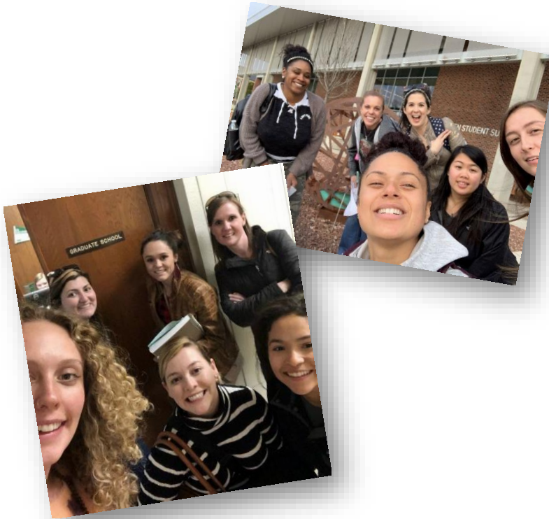
Members of the Spring 2019 Cohort Participated in a scavenger hunt at orientation as a team building activity