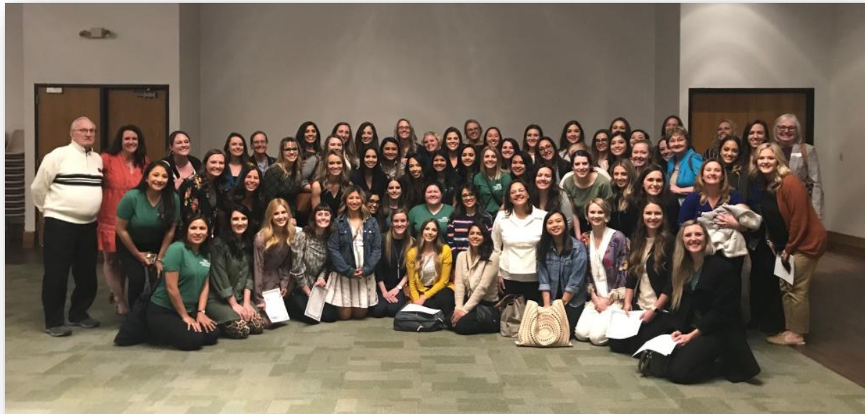
CDIS student participants in the 2019 Student Creativity and Research Conference along with their faculty research supervisors