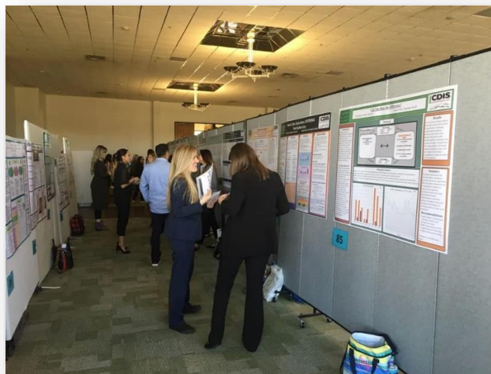
CDIS students discussing their posters with other student and faculty judges

See page 5 for a list of the CDIS student's research topics