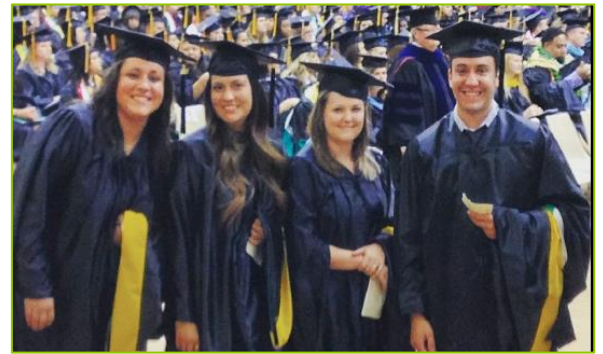
New Graduates before being hooded