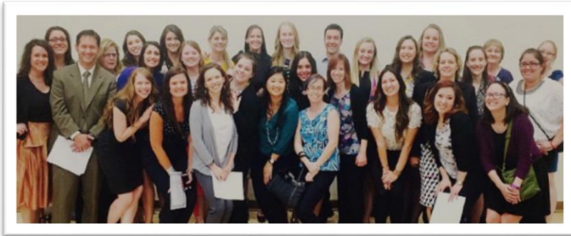
41 st Annual Student Research Conference