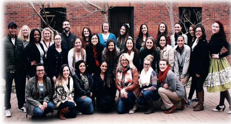
Fall 2016 cohort takes a break from new student orientation to pose for a quick picture.