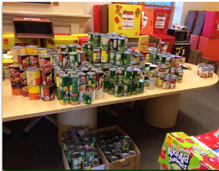
Canned goods collected during the Thanksgiving food drive.