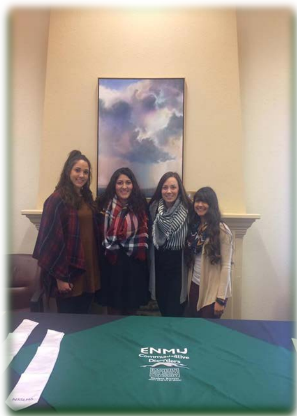
Graduating CDIS students at the NSSLHA banquet

NSSLHA members had a very fun and busy semester. Members had the opportunity to participate in the 2016 New Mexico Speech-Language Hearing Association convention. They also participated in a Thanksgiving food drive, creating over 36 boxes of full Thanksgiving meals for people in need in the Portales area. They had a successful semester and said farewell to four NSSLHA honors graduates.